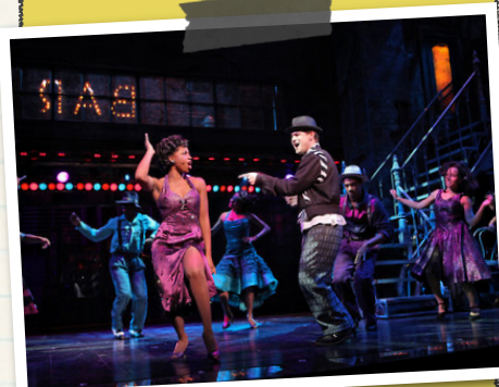
Tony nominee and RHS Theatre Alumna Chad Kimball in MEMPHIS on Broadway

Named one of the top ten high school theatre programs in America in 1996, RHS Theatre has created a world class, internationally recognized model for theatre education. The students of Roosevelt High School receive outstanding training and many have gone on to such prestigious institutions as New York University's Tisch School of the Arts, Carnegie Mellon, and Yale University. Alumni of this program are